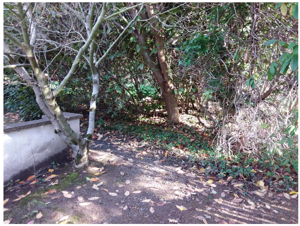
Figure 4. Looking ENE at the base of the #46 vine maple and the #45 cherry.